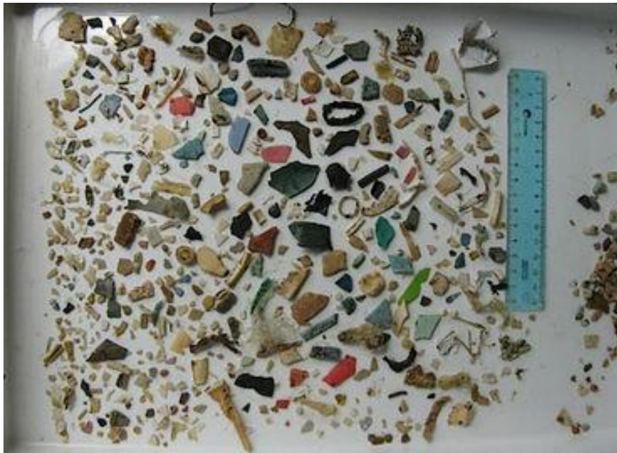
Contents of one sea turtle stomach

Promote the Junior Ranger program and trash pickups as a stewardship project.